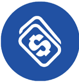
Value For Money